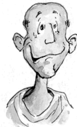
Zacchaeus