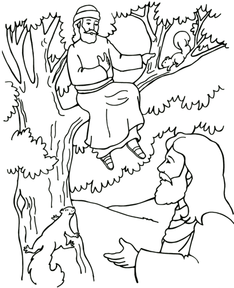
Jesus and Zacchaeus Luke 19

From Thru-the-Bible Coloring Pages for Ages 4-8. © Standard Publishing. Used by permission. Reproducible Coloring Books may be purchased from Standard Publishing, www.standardpub.com , 1-800-543-1301. Used by permission