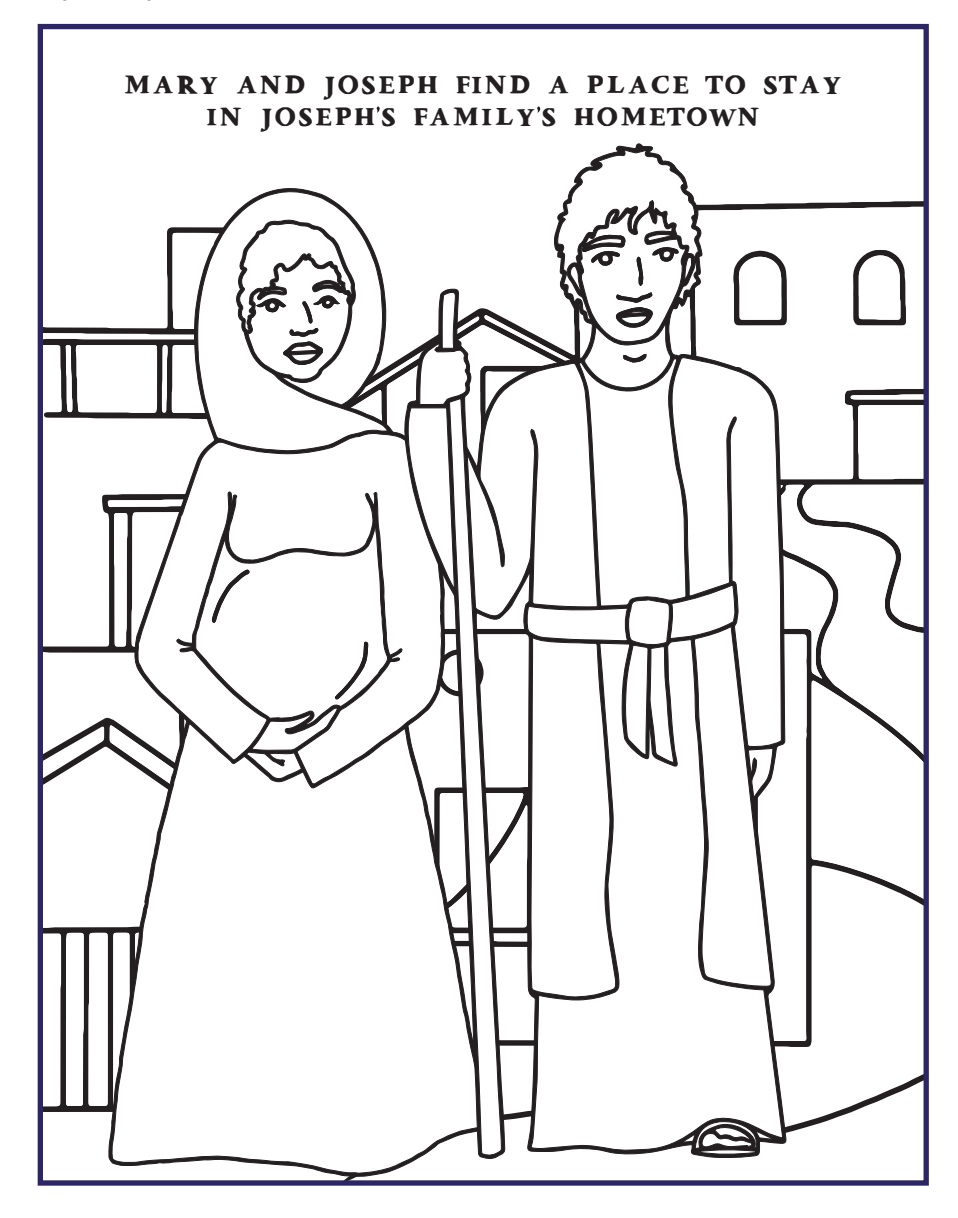
REFLECTION Joseph had to ask a lot of people before he found a place to stay. How do you think he felt hearing "no" after "no"? Have you ever felt like that?

As you color the story, add more animals and people to show that God always has room for more.