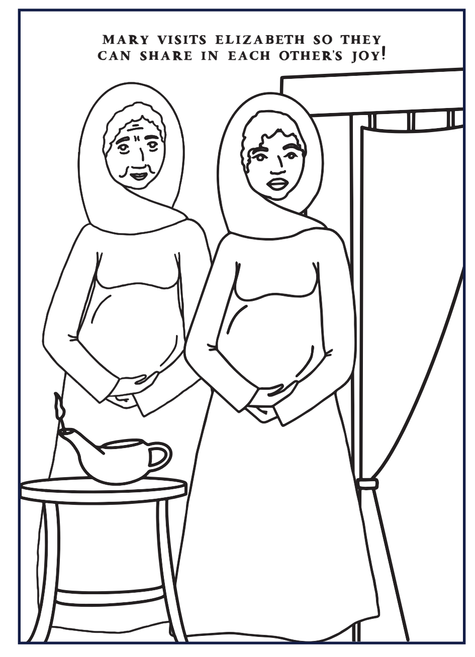
PRAY Dear God, thank you for all the people in our lives who bring joy. Help us to celebrate our friends' joy and let other people celebrate with us in our joy. In Jesus' name we pray, amen.