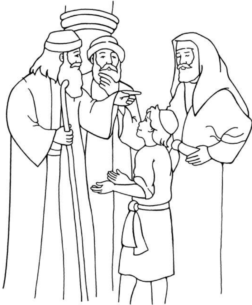
Jesus in the Temple Luke 2

Can you help Mary and Joseph find Jesus in the Temple?