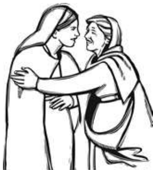
Mary Visits Elizabeth