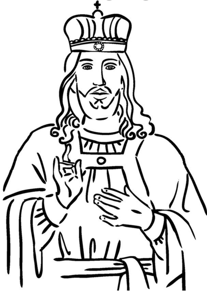
Christ the King John 18:33-37