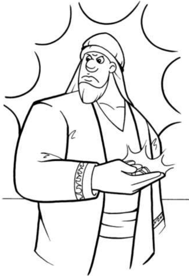
Parable of the Talents (Matthew 25:14-30)