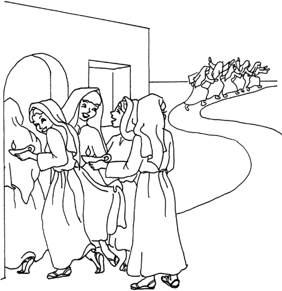
The Parable of the Ten Bridesmaids Matthew 25:1-13

Copyright © CalvaryCurriculum.com Used by Permission