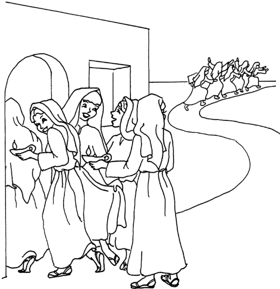
The Parable of the Ten Bridesmaids Matthew 25:1-13