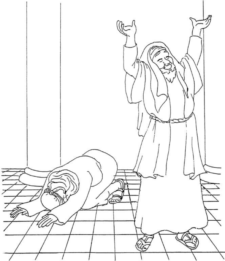
The Parable of the Pharisee and the Tax Collector