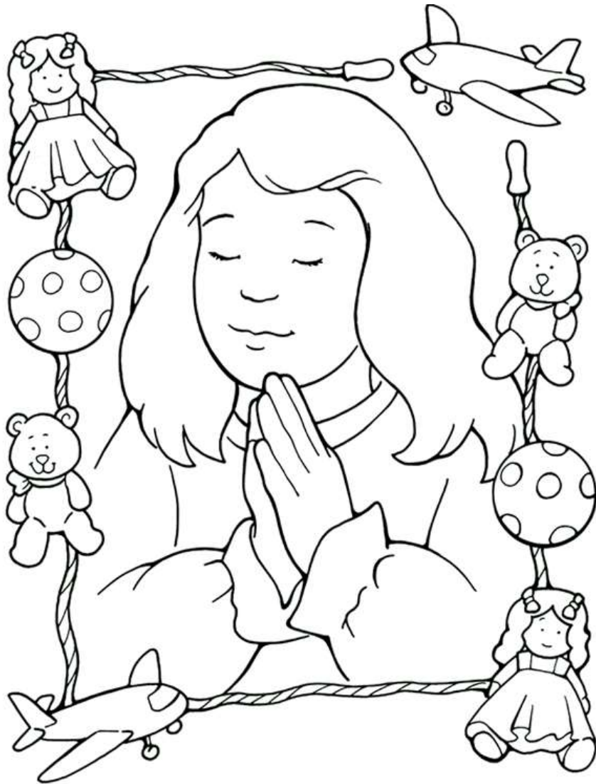
Keep on Praying

Each number represents a letter of the alphabet. Substitute the correct letter for the numbers to reveal the coded words.