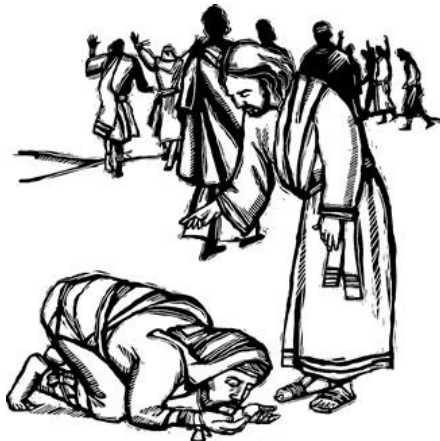
Jesus Heals 10 Lepers

Copyright © Sermons4Kids, Inc. May be reproduced for Ministry Use