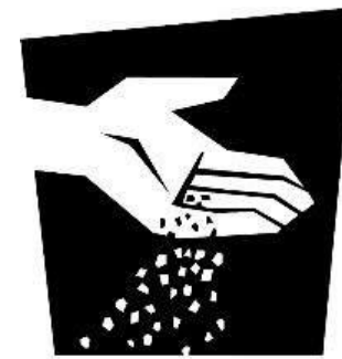
Mustard Seed Faith