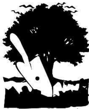
Mustard Seed Faith

Copyright © Sermons4Kids, Inc. May be reproduced for Ministry Use