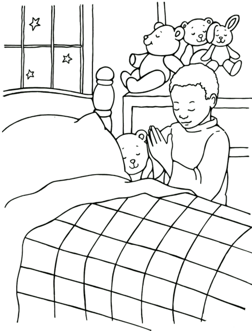
God hears my prayers.

From Thru-the-Bible Coloring Pages for Ages 4-8. © 1986,1988 Standard Publishing. Used by permission. Reproducible Coloring Books may be purchased from Standard Publishing, www.standardpub.com, 1-800-543-1301.