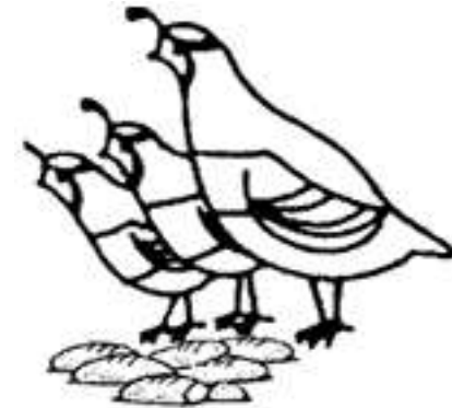
Manna & Quail