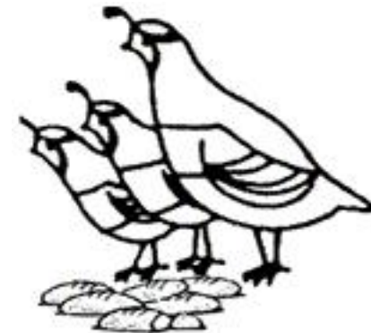
Manna & Quail