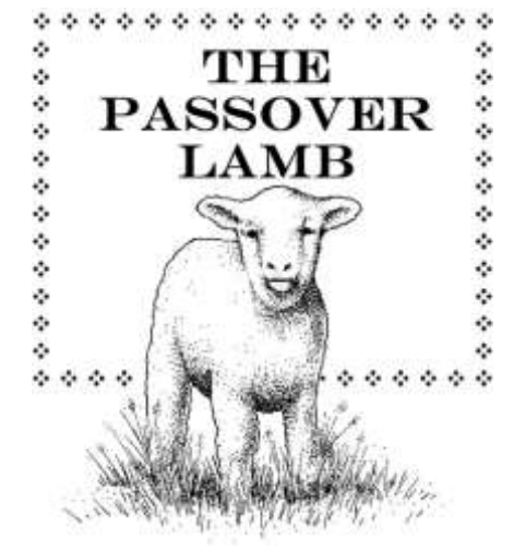
Copyright © Sermons4Kids, Inc. May be reproduced for Ministry Use