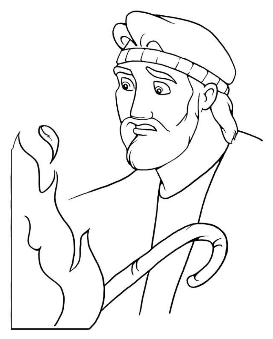
Moses and the Burning Bush Exodus 3:1-15