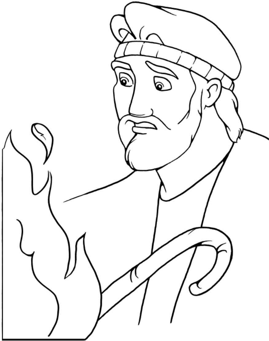
Moses and the Burning Bush Exodus 3:1-15