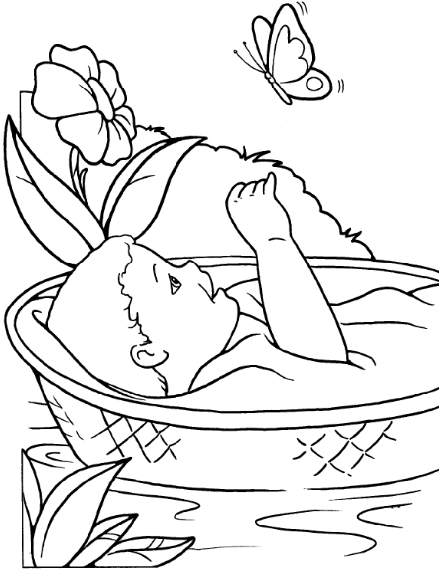
The Baby Moses by the River