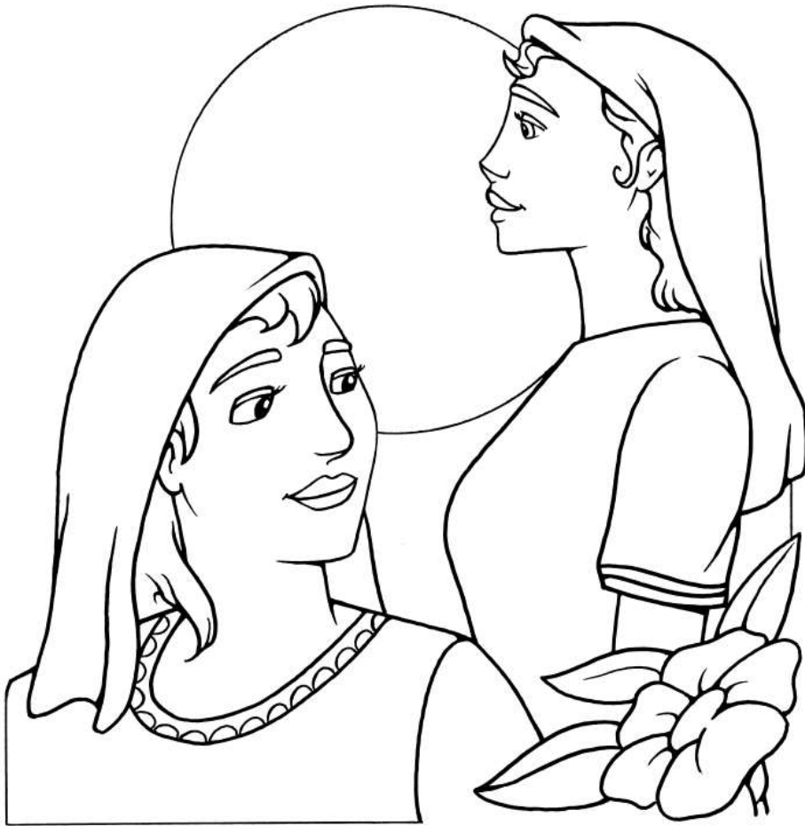
Leah and Rachel

Now Laban had two daughters; the name of the older was Leah, and the name of the younger was Rachel.