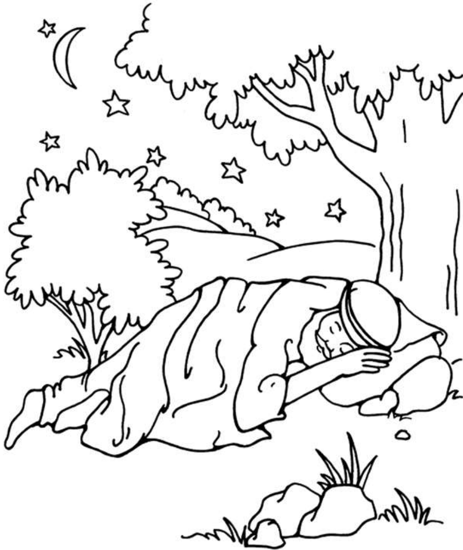
God Cares for Jacob