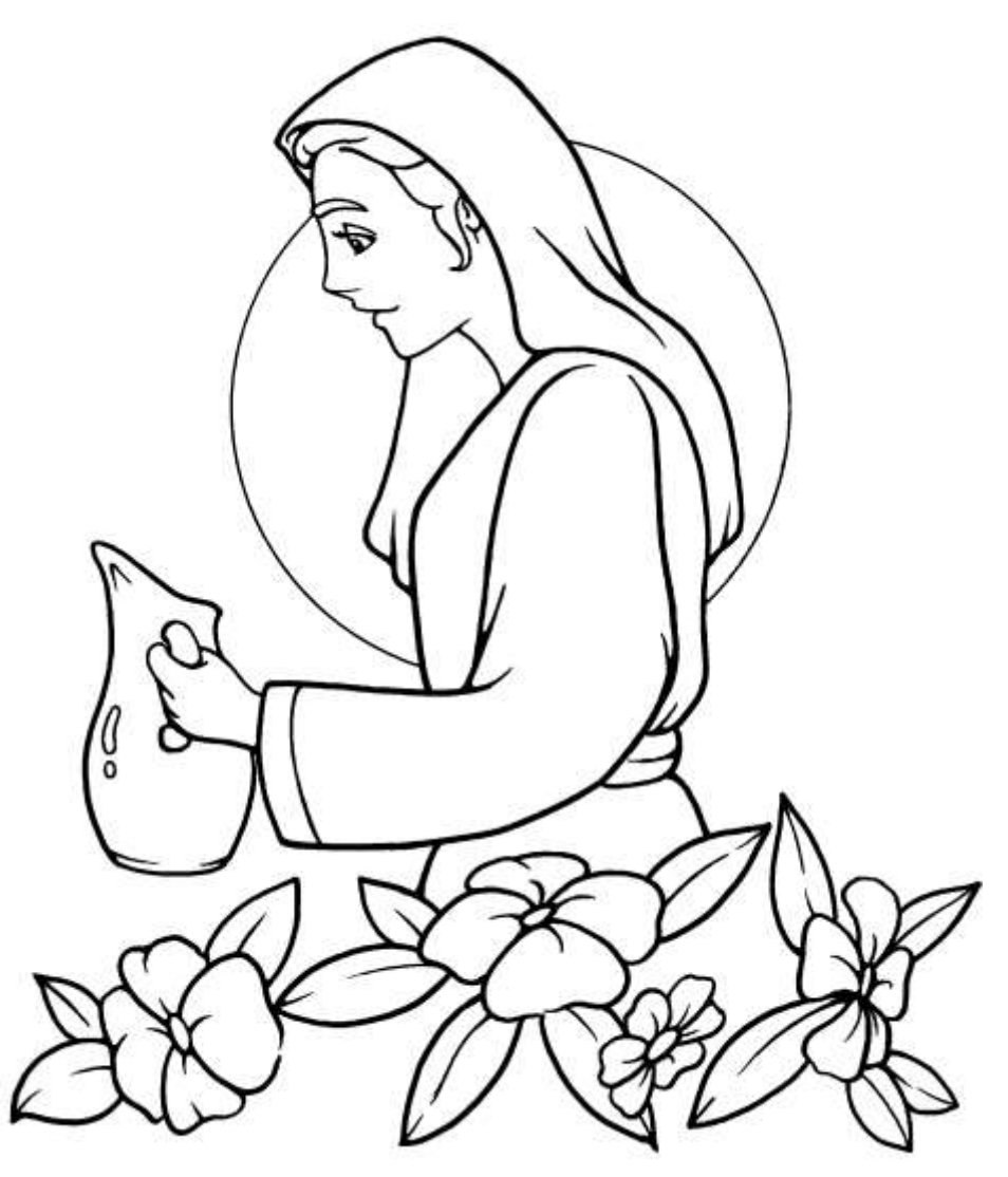
A Bride for Isaac Genesis 24:1-67

Copyright © CalvaryCurriculum.com Used by Permission