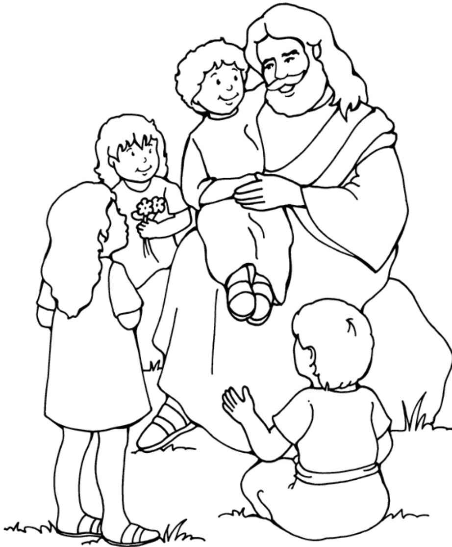
Jesus and the Children