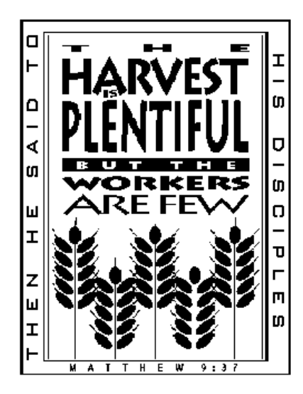
Copyright © Sermons4Kids, Inc. May be reproduced for Ministry Use