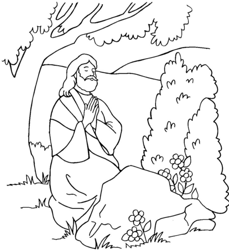
Jesus Prays for His Disciples