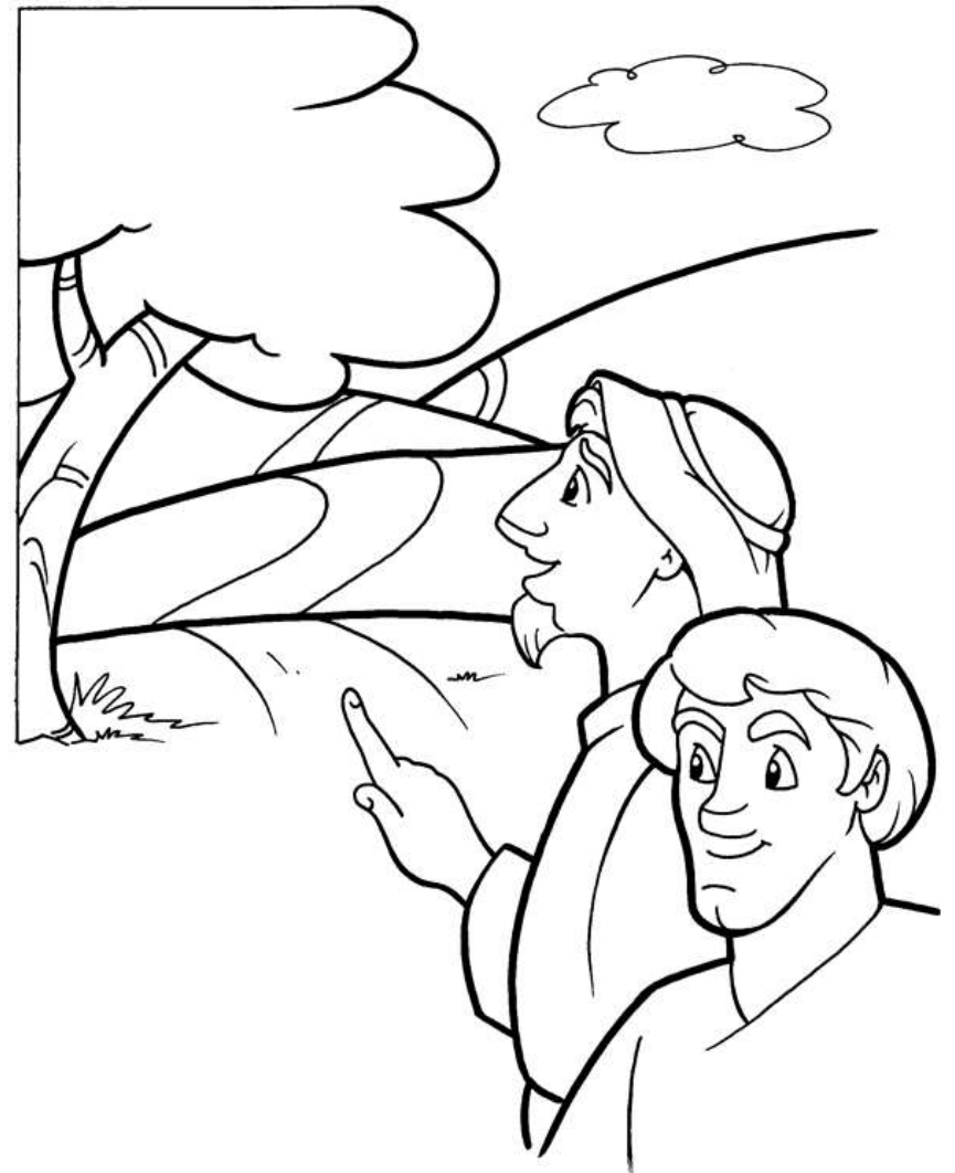
The Road to Emmaus