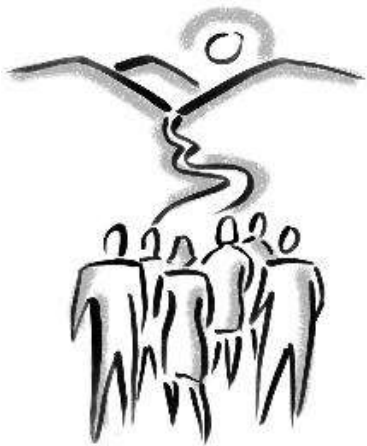
The Road to Emmaus