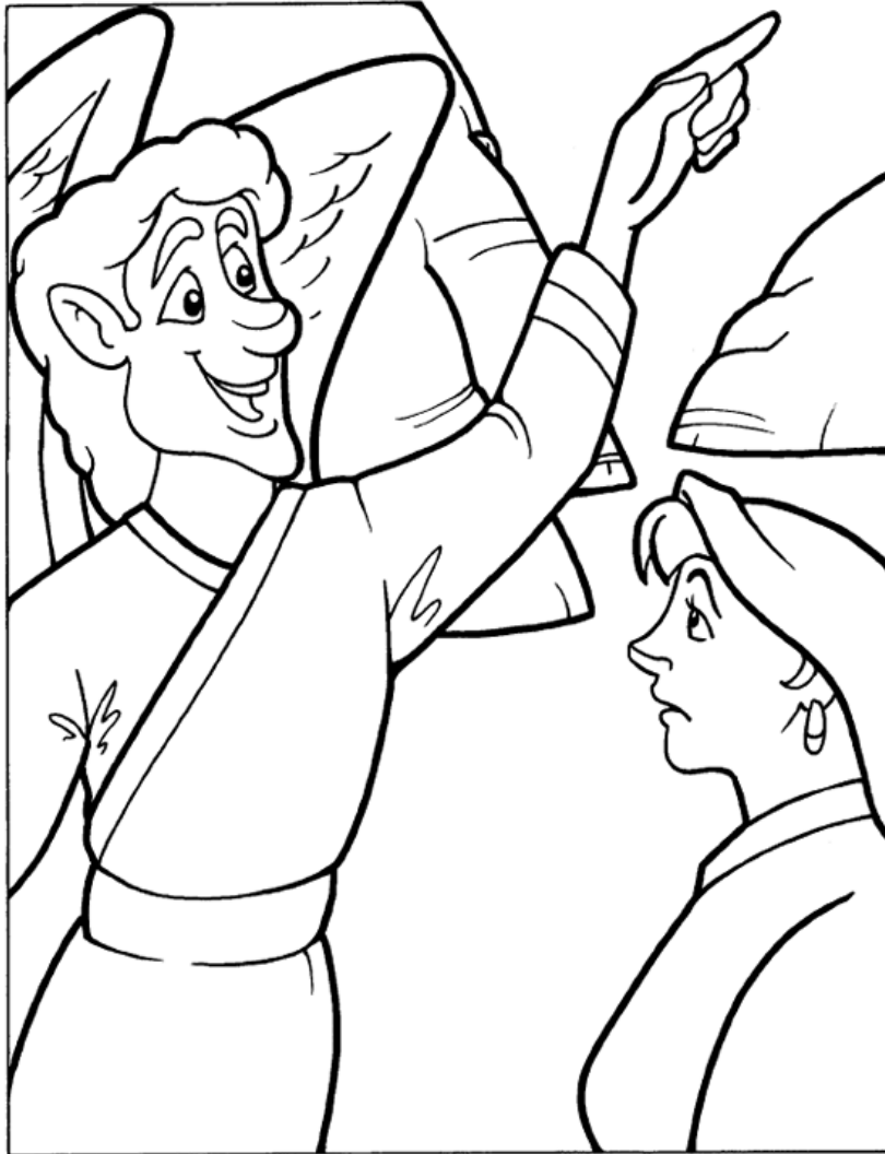
"He is not there, he is risen" Mark 16:6