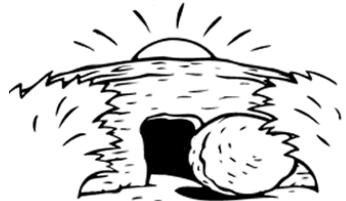
"He has risen! He is not here." Mark 16:6