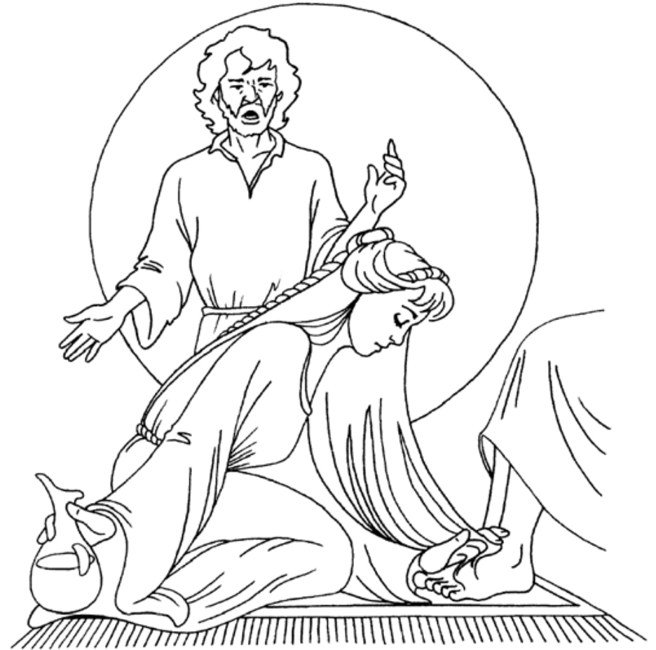
Mary Anoints Jesus' Feet John 12:1-8

Then Mary took about a pint of pure nard, an expensive perfume; she poured it on Jesus' feet and wiped his feet with her hair. John 12:3a (NIV)