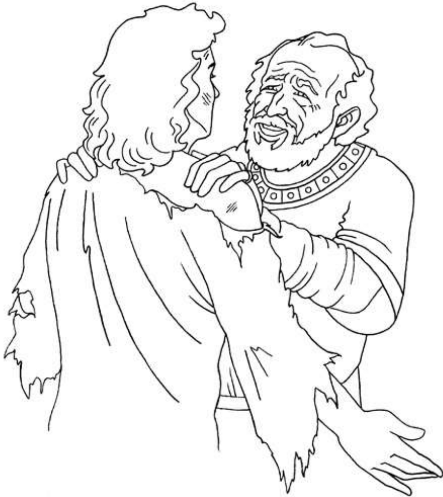
Jesus told the parable of the prodigal son. Luke 15:11-32

Copyright © CalvaryCurriculum.com Used by Permission