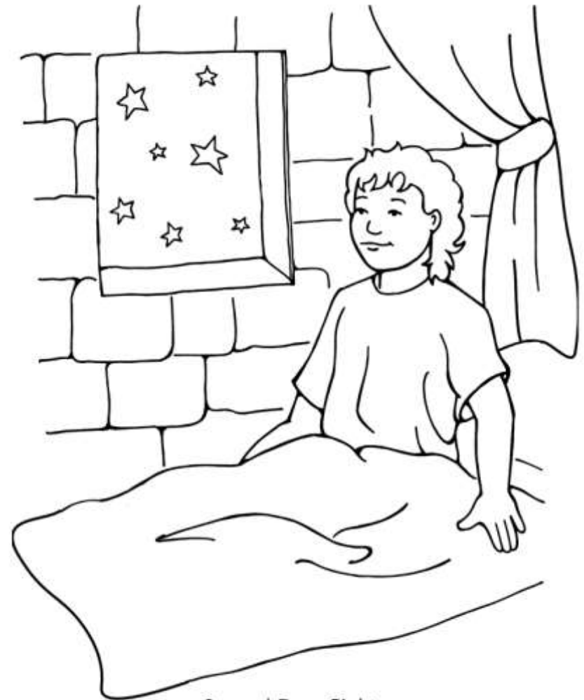
Samuel Does Right 1 Samuel 2-4, 7