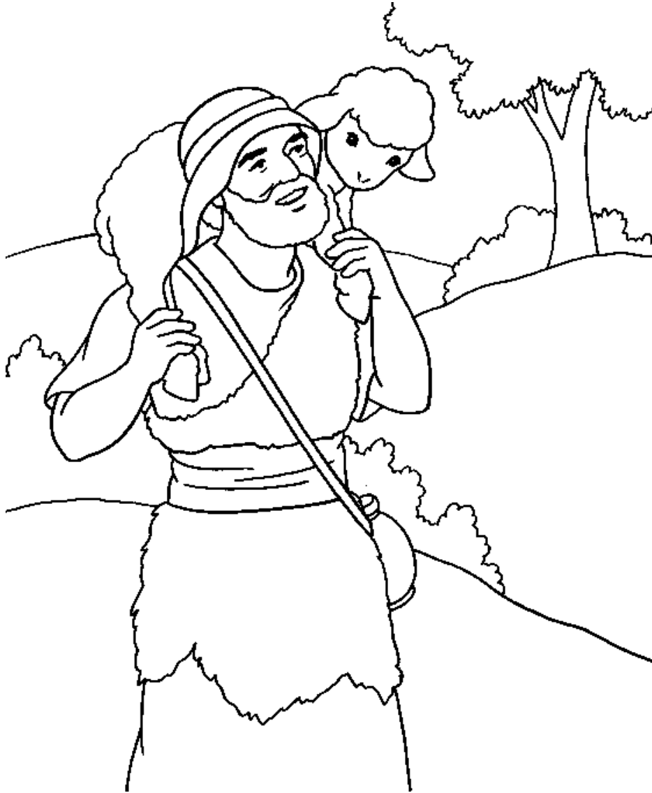
The Parable of the Lost Sheep