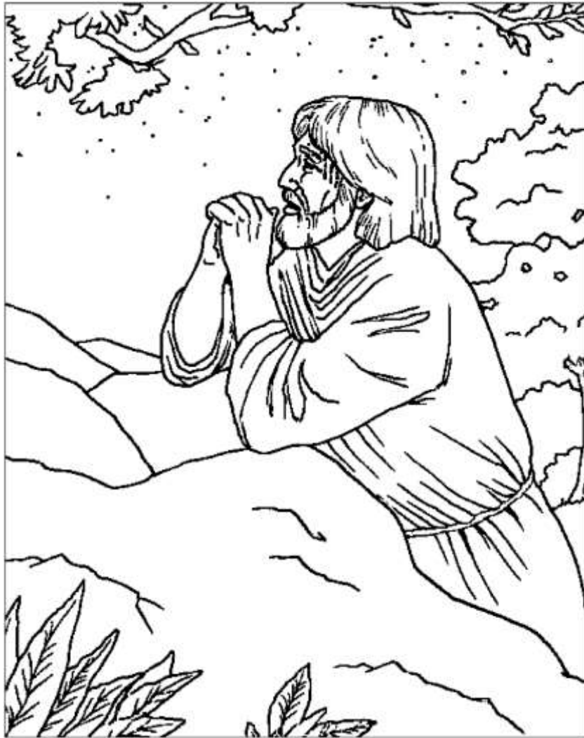
Jesus Prays for His Disciples

From BibleStoryCard Learning System'M Coloring Book© 1996 Wesleyan Publishing House Used by permission. Additional resources available by calling 1-800-493-7539 or visiting on line.