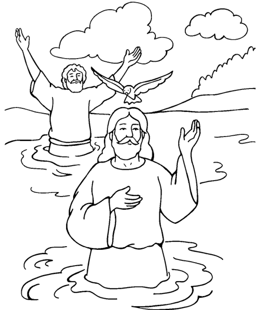
John Baptizes Jesus

From Thru-the-Bible Coloring Pages for Ages 4-8. © 1986,1988 Standard Publishing. Used by permission. Reproducible Coloring Books may be purchased from Standard Publishing, www.standardpub.com , 1-800-543-1301.