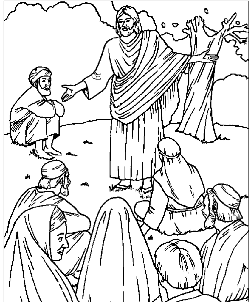
The Sermon on the Mount Matthew 5:1-12

From BibleStoryCard Learning System(tm) Coloring Book © 1996 Wesleyan Publishing House. Used by permission. Additional BibleStoryCard resources are available by calling 1-800-493-7539 or visiting online http://www.wesleyan.org/941/biblestorycards