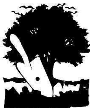
Mustard Seed Faith

Copyright © Sermons4Kids, Inc. May be reproduced for Ministry Use