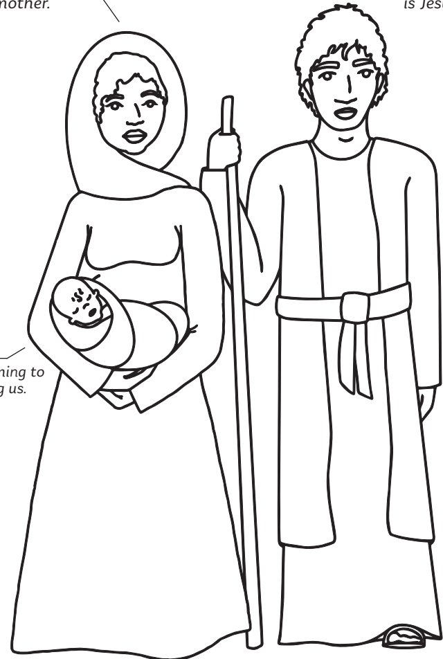
JESUS is God coming to live among us.

Christmas Eve | Luke 2:1-20 | The Holy Family