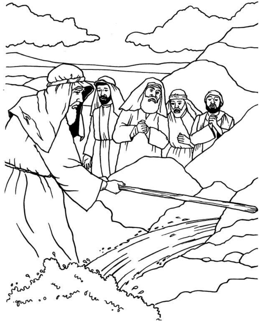
Moses Strikes the Rock Exodus 17:1-7

From BibleStoryCard Learning System(tm) Coloring Book © 1996 Wesleyan Publishing House Used by permission. Additional BibleStoryCard resources available by calling 1-800-493-7539 or visiting online http://www.parable.com/wph/group_1052.htm