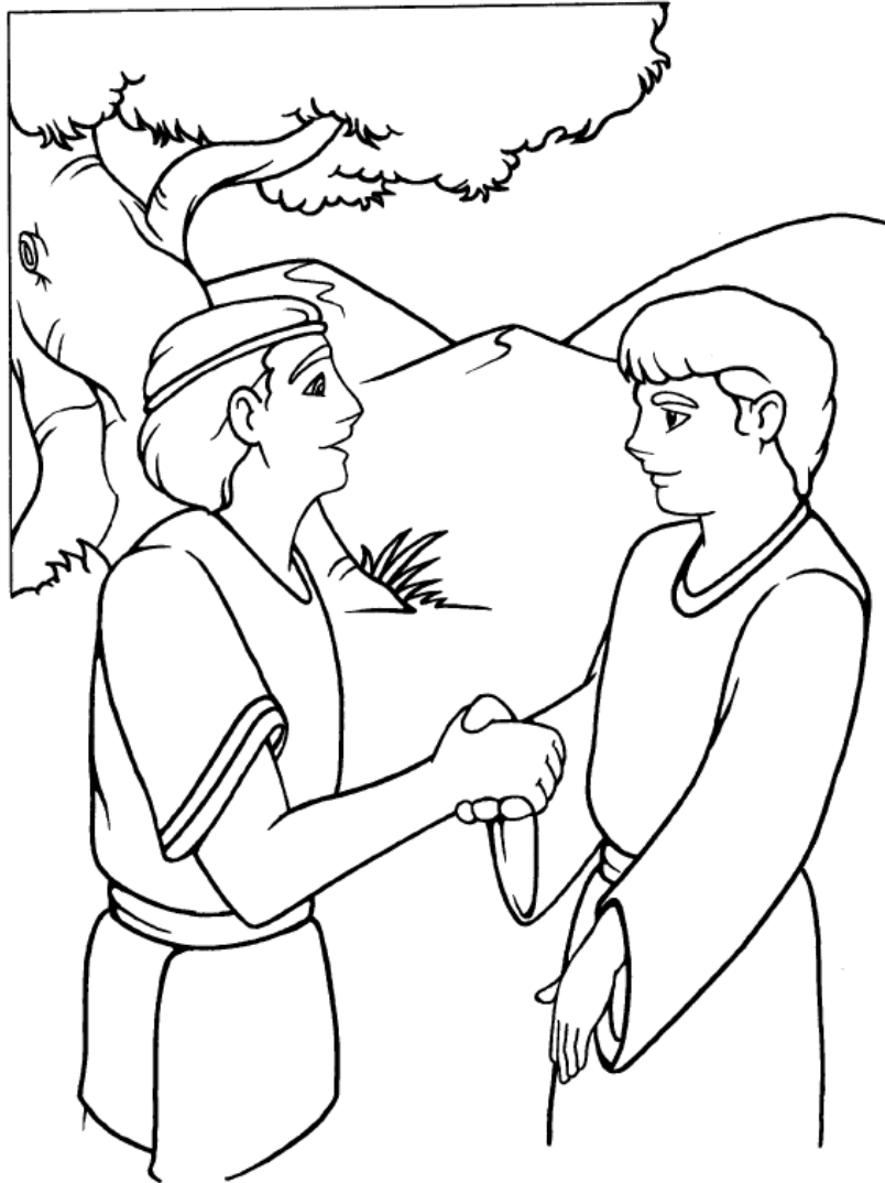
Esau Sells His Birthright to Jacob Genesis 25:19-34