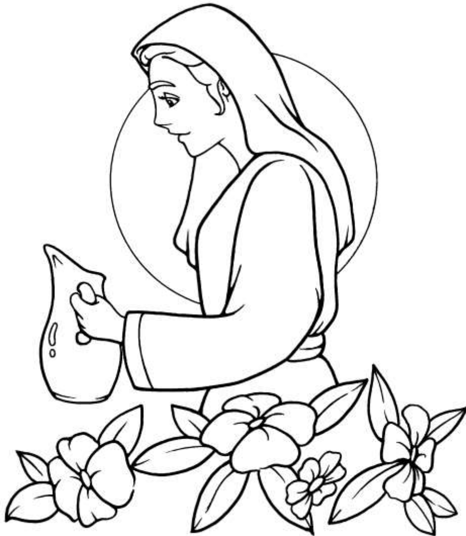
A Bride for Isaac Genesis 24:1-67

Copyright © CalvaryCurriculum.com Used by Permission