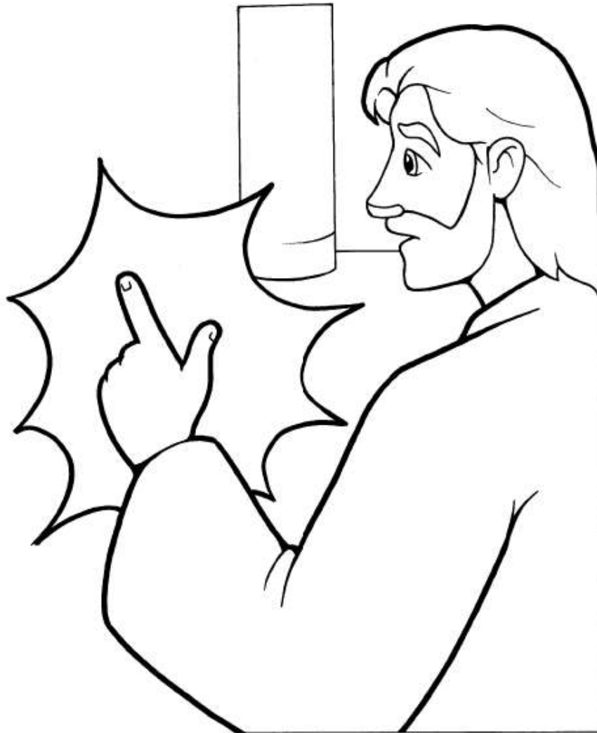
Jesus Appears to the Disciples